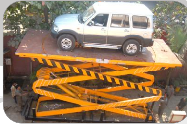
Double Scissor Car Lift