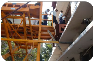
Turntable on platform as well as ground