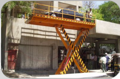
Single Scissor Car Lift